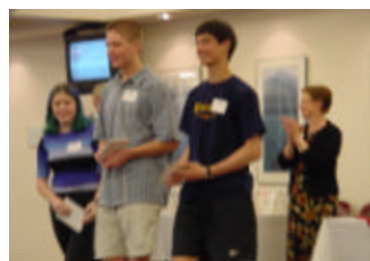
Team from Eden Prairie High School